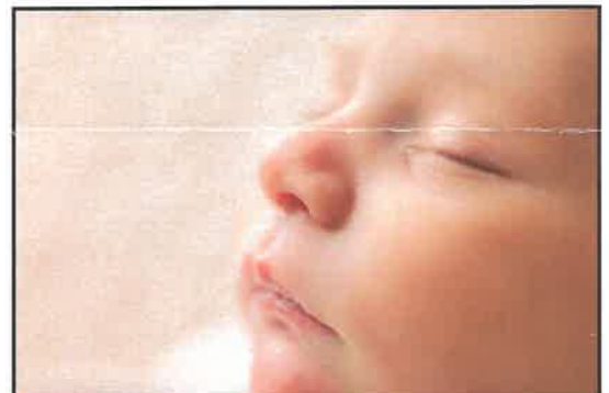
You can help make abortion unthinkable!