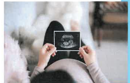
You can make all the difference!