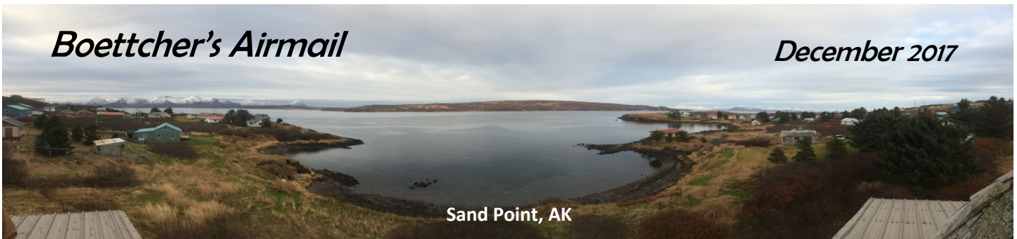
Sand Point, AK