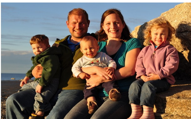
Our First Prayer Card picture serving with MARC

We have been with MARC for a long time and we are very close to our MARC family. It will be hard