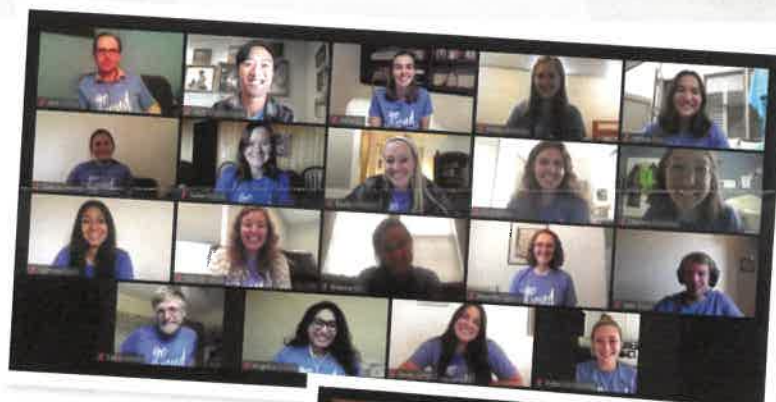
TOP: Because of COVID, GoWeek 2020 was a virtual event, so the class of 2020 team picture is fitting of our times! BOTTOM: Our staff team showing off our 'quarantine hobbies' for a video we made for our Goers in March.

2021 will be a year of experimenting with new ways of connecting with and mobilizing students and a year of starting new and deep partnerships with a few key collegiate ministries and campuses. We as a GoCorps staff team are so thankful for each of you, and we are more ready than ever to pray, listen, step out in faith, and do everything we can to mobilize this generation, lifting their eyes to the harvest and equipping them to be sent!