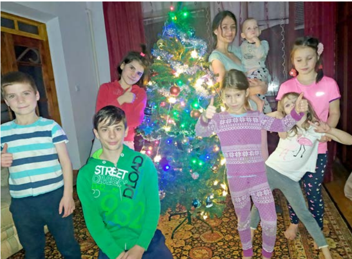
Our Home of the Good Shepherd family in Nisporeni, Moldova, decorates for Christmas this year. Due to Covid-19 travel restrictions, we have been unable to travel to Moldova since last year at Christmastime.

John 3:16, the "Golden Verse of the Bible," expresses this profound truth in mostly monosyllabic words that even a child can understand. The greatest gift to receive at Christmas is to understand that God loves you and that He sent His son Jesus down to earth to save you from your sins. Could there be a greater gift than that which brings love, peace, joy, purpose and eternal life?! This is our message this Christmas to the children and adults we are serving in Romania and Moldova: God loves you and He sent His son Jesus to bring you back home with Him.