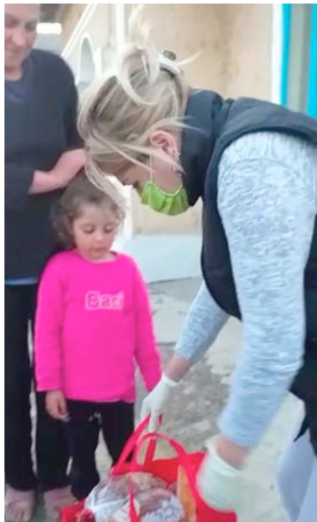
Grateful recipients of food provided by FGCI during the Coronavirus shutdown.

We keep doing our job from a distance, helping with goods delivery and phone call counseling (for children, workers in centers, poor families), because we need FGCI's ministry to keep going without obstacles. With God's help and your open heart, our desire is to continue to help the people in need so that we can bring a sparkle of hope during these hard times.