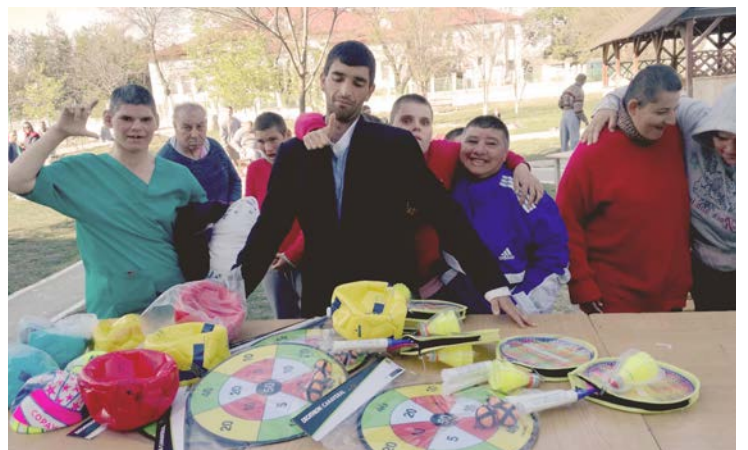
At the Zebil center, adults with special needs are delighted to receive sports equipment to play with on the center grounds.