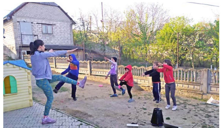
Morning calisthenics at Home of the Good Shepherd in Nisporeni, Moldova.