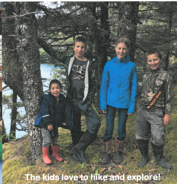
The kids love to hike and explore!

Luke 2:10 And the angel said to them, "Fear not, for behold, I bring you good news of great joy that will be for all the people."