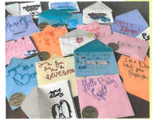
Cards welcoming new babies were created by youth at Northern Ministry Training, and by children at PenCC. The card creators were encouraged to pray for the new babies and families to receive their artwork cards.

Churches have long been a support backbone for ABC in spiritual, financial and physical ways. Recent examples include the donation of 16 new baby layette bags with care, bath and clothing essentials and special baby items for the ABC Care Closet from Peninsula Christian Center in Soldotna, along with cards drawn and decorated by children at PenCC. In response to a need, youth from Northern Ministry Training also created beautiful cards and wrote messages for new baby families for ABC to distribute. All of the card-makers were encouraged to pray for each baby and family to whom the cards will go. (See card photos at right.)