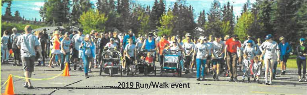
2019 Run/Walk event

One of the primary fundraisers for ABC Life Choices, the 2021 Celebrate Life! Carry the Light 5K Run & Walk will happen in person this year on Saturday, August 7 at Soldotna Bible Chapel. Registration opens at 8:30 a.m., runners start at 10 a.m., and walkers start shortly after. From serious runners to family walkers, it's a great way to enjoy our beautiful summer and make a lasting difference for families. Local vendors will sell morning coffee and food.