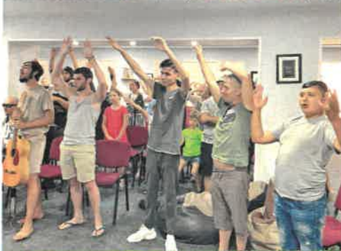
«« Singing songs of praise and worship at camp with our Roma kids is always an uplifting and enjoyable experience.