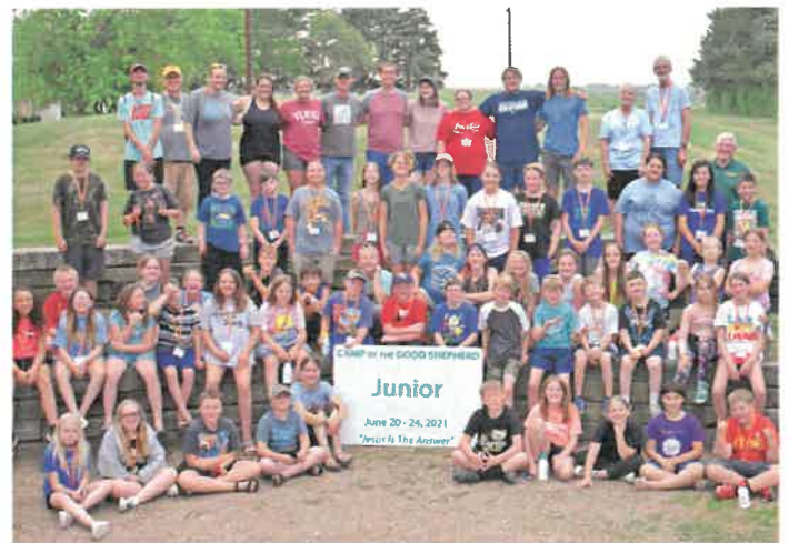
Pictured above: Camp of the Good Shepherd 2021 Junior Camp. This summer we had 198 total campers and around 100 workers. Many young people made decisions for Christ this summer, including 16 who surrendered their lives to Christ in baptism. Praise God! Camp is back!!

It did my heart such good to be able to open up our camp facilities for graded Summer Bible Camps at Camp of the Good Shepherd (CGS) this summer. I sure was happy to be with my Junior Camp kids (fifth and sixth-graders) this summer (my 14th year of leading as dean at CGS Junior Camp). Overall, we were down a bit in attendance at our camps this summer, but we still had some great camps with right at 200 campers total attending our six graded Bible camp sessions. This year's theme was "Jesus Is The Answer" (based on John 14:6). One of the most exciting aspects of camp sessions this summer was the number of kids who surrendered their lives to Christ in baptism. Among our Junior, Junior High and Senior High Bible camps, we had a total of 16 baptisms! Praise God!