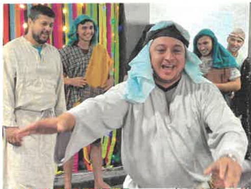
Bible dramas teach important lessons about faith.