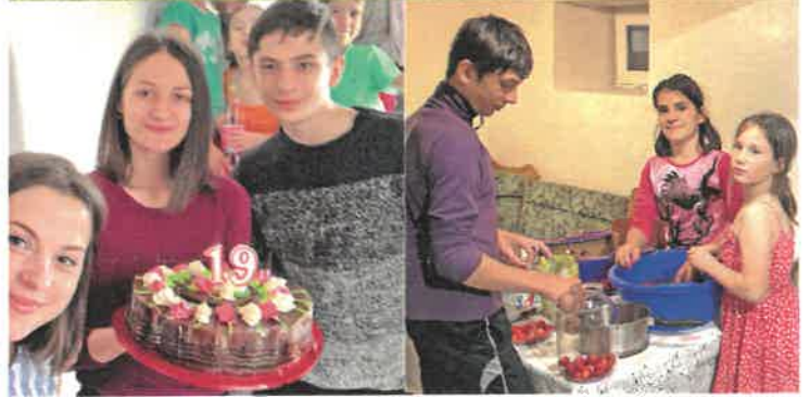
Top: Life is good for our Home of the Good Shepherd foster kids!