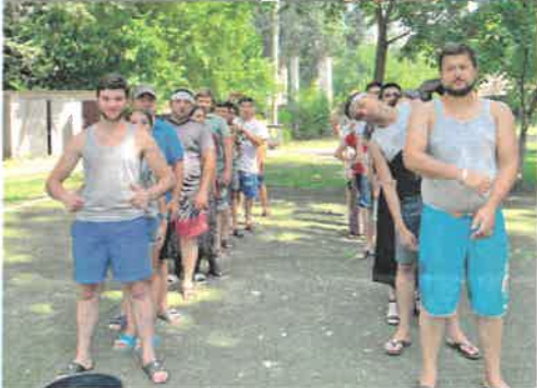
«« Exercise and fun, competitive games are always part of our Bible camps.

the Good Shepherd], because it will be a big job. On the street [where our home is located in Nisporeni], we will start working with some families. God is wonderful.