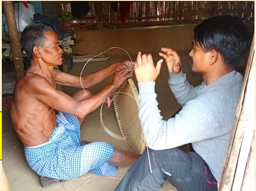
One of the storytellers sharing a Bible story with a laborer

For no one can lay any foundation other than what is being laid, which is Jesus Christ. 1 Corinthians 3:11 (NET)