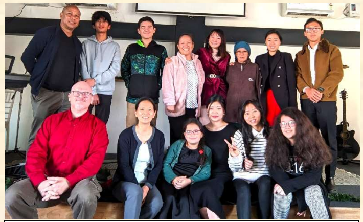
New Year’s Day with members of our church in Asia

Going deep - Just recently, I got to use Bible stories for a week of “story-based trauma healing” training. There were 7 young adults who learned about heart wounds, how to grieve well, how to listen well, etc. In one lesson on forgiveness, there was a story about a person who stole from his neighbors. That same day, five of the participants’ cell phones were stolen! The police were informed, and we are praying for the return of the phones. At the same time, the participants were so thankful that they could use the principles they learned to be at peace in that painful experience.