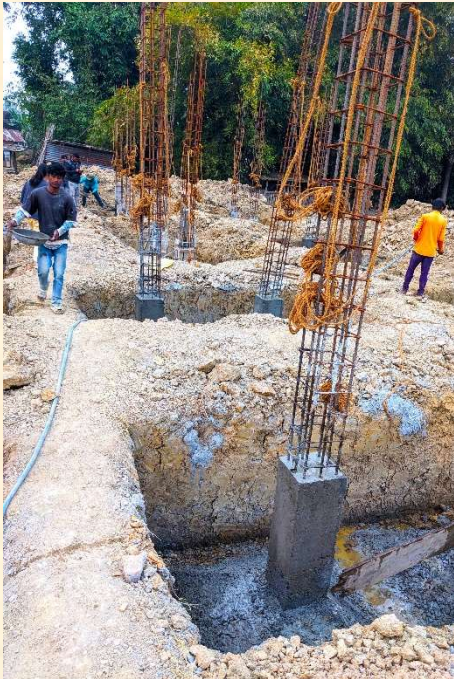
← Our house's foundation!