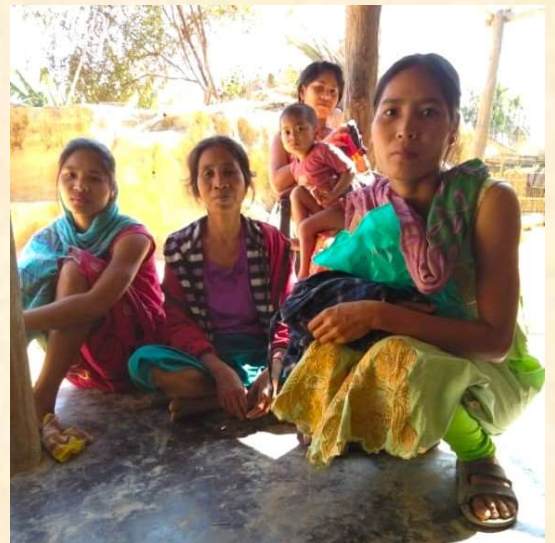
A Bible "SFG" – Story Fellowship Group

In addition, when Bible stories are being shared and discussed, people are hearing it and engaging with it. It's not enough to own a printed Bible – you have to engage with it too! Bible storying helps people practice that before and after they get a printed Bible.