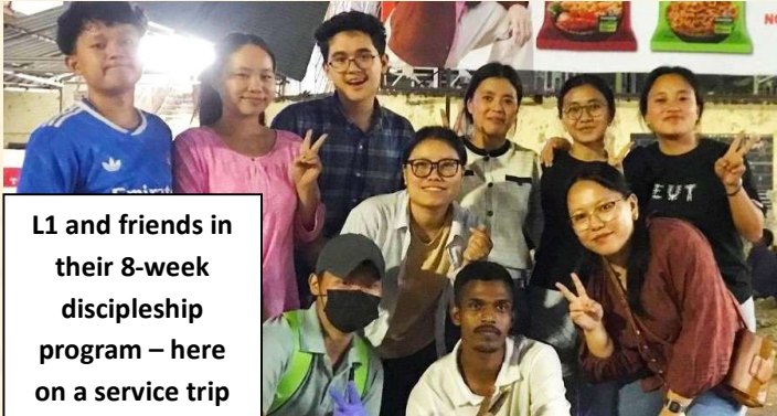
L1 and friends in their 8-week discipleship program – here on a service trip

Contracting Out – Since coming overseas, we have always been members of Wycliffe. We have also been associated with partner organizations that we can’t always mention for profile reasons. However, I can tell you the partner we work with to do apps and websites: Kalaam Media . Look them up at www.kalaam.org .